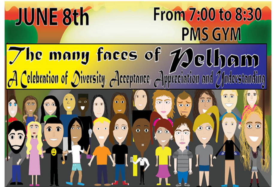
THE MANY FACES OF PELHAM MUSEUM WALK

We hope you enjoy the displays, performances and videos being shared with you this evening.